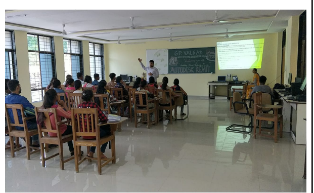
Autodesk Revit Finishing School Program (04/06/2019)